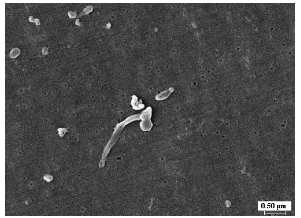
Figure 2: SEM micrograph of UHMWPE debris isolated from serum

to ellipsoidal in shape, displaying morphology similar to previously published experiments (Figure 2) [5,6].