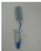
Figure 1: Pump/tubing/collection assembly after completion of polystyrene experiment.

Visualization of blue suspension in the collection vessels was used to confirm delivery of polystyrene particles. Spectrophotometry (595nm, BioRad, Hercules, CA) was used to perform turbidity analysis for determination of the concentration of particles in the collected suspensions.