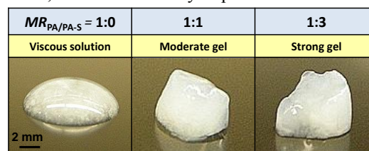
Fig. 3. Composite PA nanomatrix hydrogel modulation.

Conclusion: PAs inscribed with isolated ligands were able to direct hMSC osteogenesis without OSM. Mechanically tunable hydrogels were developed, and HA integration efforts begun to create a true bone ECM mimetic. Further study of PA hydrogels with HA and corresponding cell response via osteogenic gene expression still remain for future experiments. Overall, these results establish the beginnings of a new, versatile approach to regenerate bone tissues by closely following natural tissue formation.