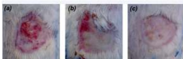
Figure 2. Burn wounds contamination with P.aeruginosa and treated with a non-adherent dressing (Melolin ® ) remained open after 2 weeks (a), whereas wounds treated with the proposed material at fast and slow release rates of gentamicin (b, c respectively) demonstrate better epithelialization.

Results: The freeze-drying of inverted emulsions technique was found to be very useful in enabling to attain dressing materials with a wide range of burst effects (5-95%) and varying elution spans (5-50 days), based on predominantly on microstructuring of the matrix. Select compositions were found to produce a 99.99% decrease in the viable counts of very high initial inoculations of 10^7 - 10^8 CFU ml -1 of Pseudomonas aeruginosa and Staphylococcus albus after only 1 day, and a similar decrease in Staphylococcus aureus counts within 3 days. Bacterial inhibition zones around the dressing material were found to persist for 2 weeks, indicating a long-lasting antimicrobial effect. Despite severe toxicity to bacteria, the dressing material was found to have no toxic effect on cultured fibroblasts. In vivo evaluation of the dressing material in contaminated deep second degree burn wounds in guinea pigs demonstrated its ability to accelerate epithelialization by 40% compared to an unloaded format of the material and a conventional non-adherent dressing material. Wound contraction was reduced significantly, and a better quality scar tissue was formed. Faster epithelialization of the wound was measured in both fast and slow release strategies, but was significantly better when treated with a slow release rate.