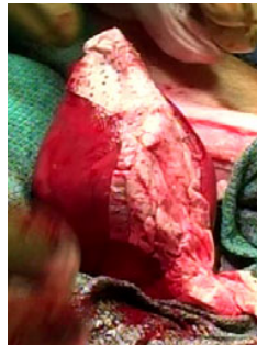
Figure 2. Hemostasis achieved on a lethal grade 5+ pig liver resection model by application of LFS coated PLA nanomesh.

Conclusions: In this work we demonstrate that it is feasible to make an ultrathin resorbable, pliable hemostatic device, which minimizes the use of biopolymer and fibrin sealant. The ultrafine nature of such