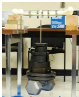
Figure 2. Competition set-up

Figure 1. A student team setting up their implant. Students were required to design an implant that filled the entire space of the defect and the total cost of materials could not exceed $15. No power tools were allowed during the competition, but hand tools were allowed. Teams were also required to present a poster on their implant design. The posters included a description of basic bone anatomy, physiology, and/or bone healing, identification and description of materials, a design and materials rationale, and a budget breakdown of materials. The students' posters and designs were judged by biomedical engineering undergraduate and graduate students. The scores for the team included scores for design, presentation, poster and the amount of weight held. Once the implants were set up in the bone defect, the stabilization of the sawbone was tested using three point bending (Figure 2). The weight of failure of the sawbones with defects but no implants was found to be approximately 28-30 kg.