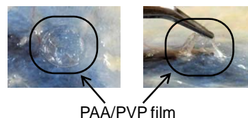
Fig. 2 Adhesion of the PAA/PVP gel to the tissue

When the cecum was injured, and replaced in the peritoneal cavity, the organ strongly adhered to other intestines or peritoneum in days. The PAA/PVP film stuck to the burned site could effectively prevent the adhesion formation. The PAA/PVP gels are slowly dissolved at pH 7.4, and those left in the peritoneal cavity completely disappeared in several days.