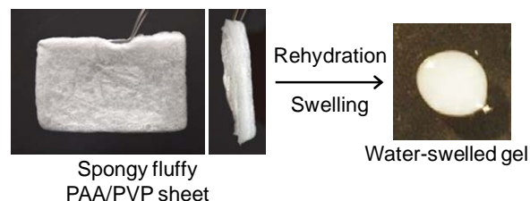
Fig. 1 Water swellable PAA/PVP spongy sheet

pouring PVP solution onto a dried PAA film, lyophilization afforded a water-swallowable white spongy sheet (Fig. 1). It immediately formed a soft hydrogel on a wet tissue, and stuck to it (Fig. 2). The resulting PAA/PVP hydrogel was slowly dissociated at pH 7.4.