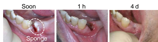
Fig. 3 Hemostatic effect of PAA/PVP sponge on dental surgery

Clinical study of the PAA/PVP complex to control the bleeding after tooth extraction was performed on the patient taking Bayaspirin, an anticoagulant preventing blood clot formation. After tooth extraction, the PAA/PVP complex sponge was placed into the socket. The sponge absorbed the blood, and swelled to a hydrogel. It adhered to a bleeding site, and arrested the hemorrhage effectively, even in the anticoagulated patient. (Fig. 3).